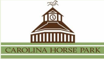
Cross Country Water Complex